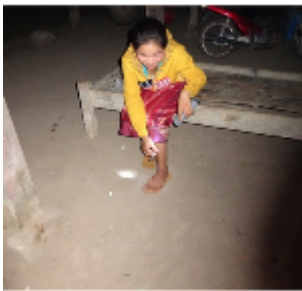
Figure 2. Human landing catching in Khamouane province

Every village was divided into four zones from a central axis to select at random 1 house by zone. The selected houses were distant from each other by at least 30 meters. For every house a collector was placed inside and another one outside from 6:00 pm in the evening till 6:00 am in the morning on 4 consecutive nights. Mosquitoes were collected with glass tubes (Figure 2). Mosquitoes were also collected overnight with the cow bait collection method. A long mosquito net was disposed around the animal and adult mosquitoes were collected on it (Figure 3).