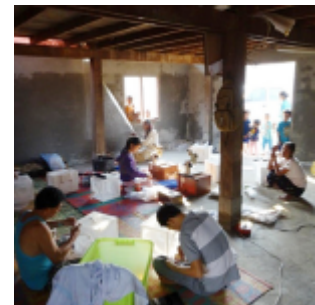
Figure 4. Field laboratory in Attapue province