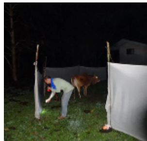
Figure 3. Cow bait collection in Bokeo province