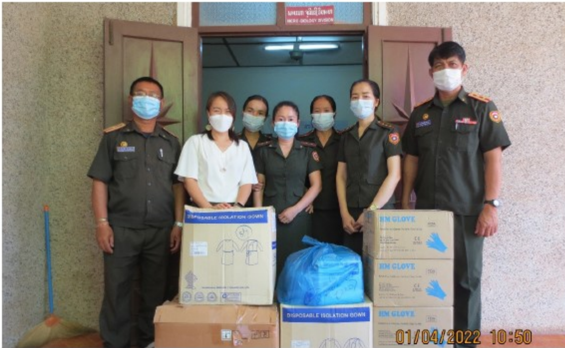
Annual handover the laboratory consumables to the surveillance site, at Lao Army institute of disease prevention.