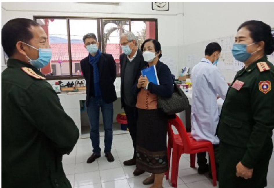
Surveillance site visit in Laboratory section, at 107 hospital, Luang Prabang province, on February 22, 2022