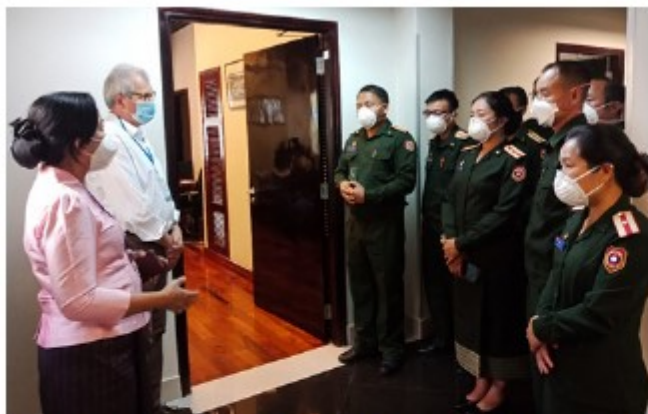
Biosafety officer trainees visited IPL during their first module of Biosafety and Biosecurity training, on February 04 th , 2022, organized by Arboshield project.