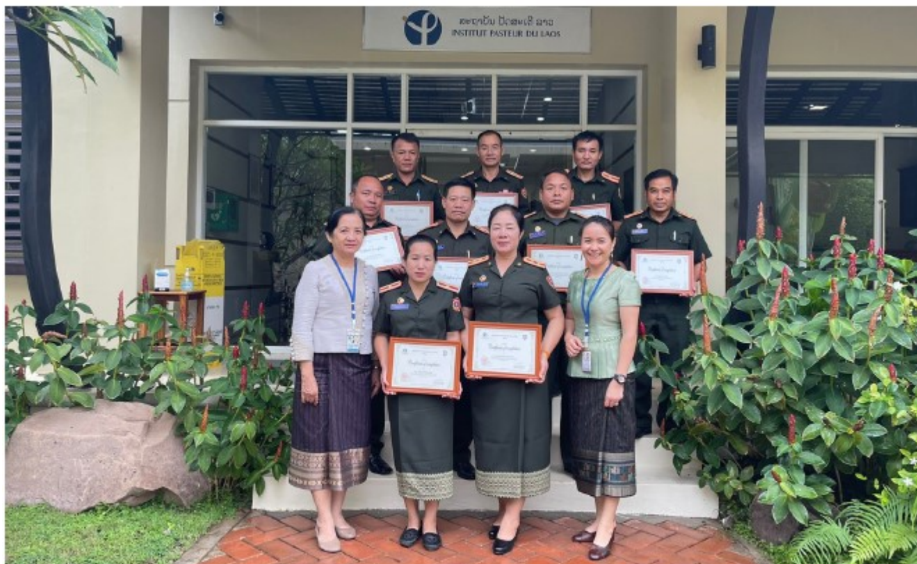
Completion of four modules on Biosafety and Biosecurity training for high-ranking leaders from military hospitals over the country, on September 09 th , 2022