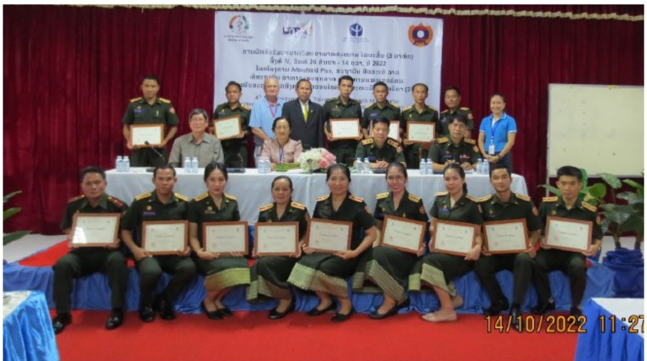
4 th field epidemiology training (FET) 3-week short course, on September 26 – October 14, 2022, at Lao tropical and public health institute (Lao TPHI).