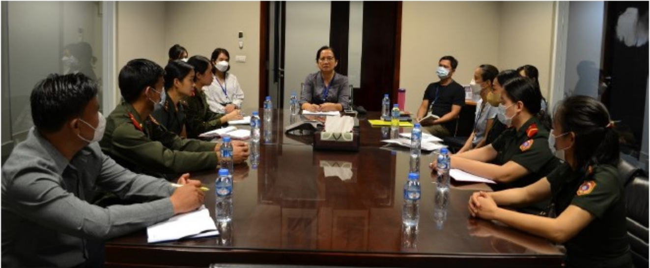
Reception of On-the-job military trainees at IPL, on September 01, 2022.