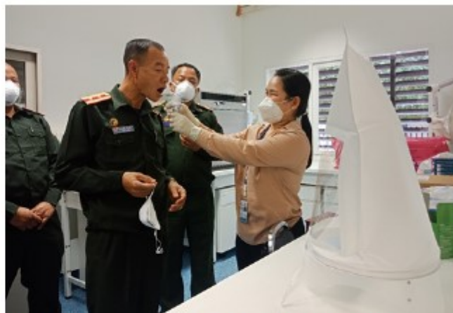
Fit-testing exercise was performed during the training practical section