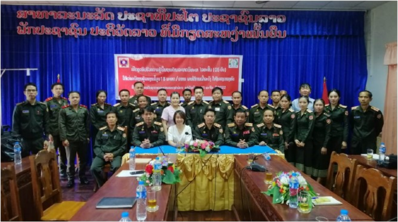
1 st FET 5-day workshop for 15 military medical staff, on November 21-25, 2022, at Khammuan provincial Military Command.