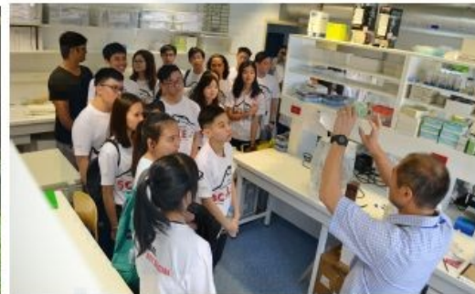
12 March, 2018: Study tour of high school students from Singapore