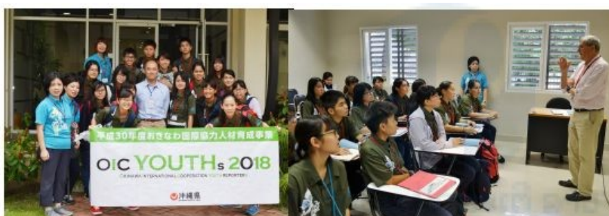
31 July, 2018: Visit of Okinawa International Cooperation Youths 2018 (Okinawa, Japan)