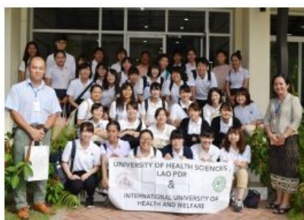
6 August 2018: Study tour from International University of Health and Welfare, Japan