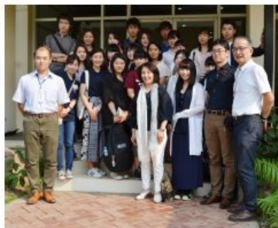
15 March, 2018: Study tour from Keio University School of Medicine, Tokyo, Japan